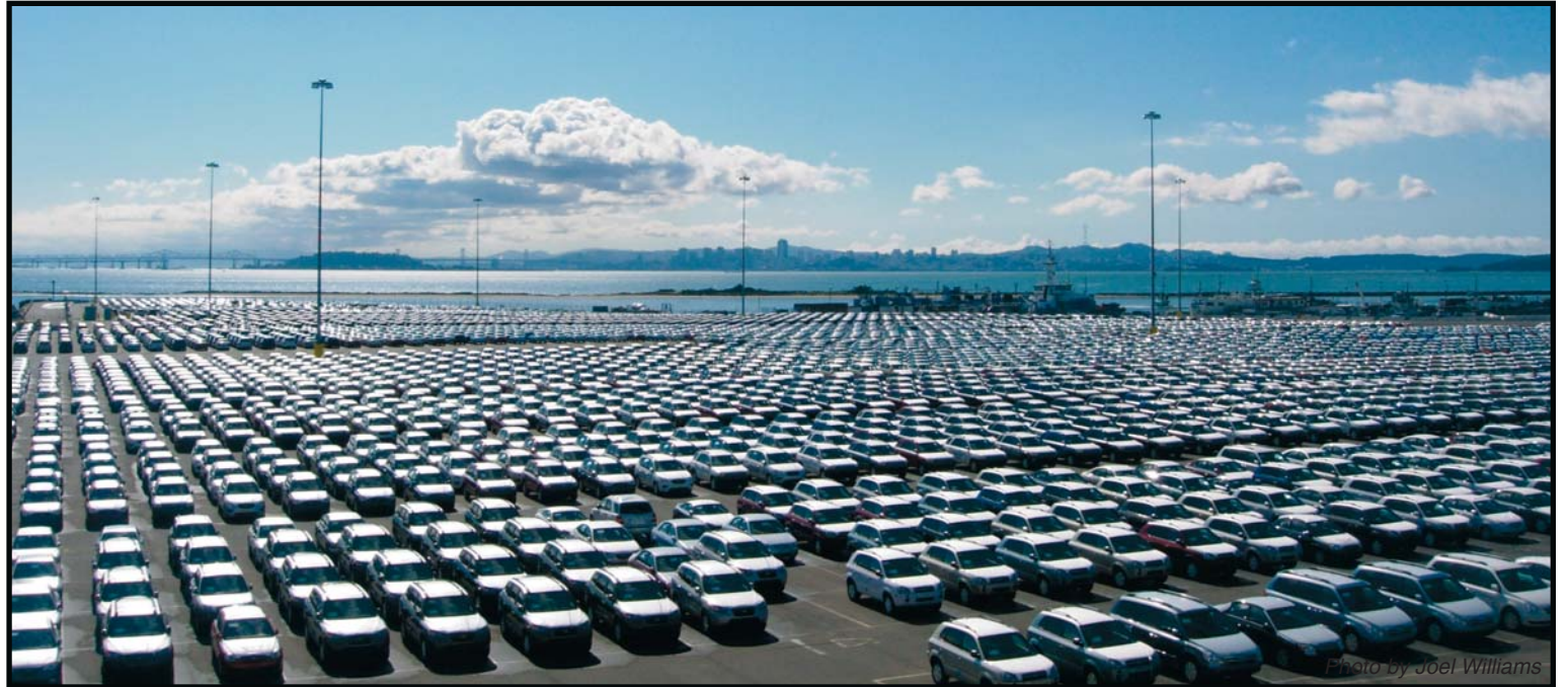
The Auto Warehousing Company can store up to 10,000 autos at the Port of Richmond

One business that has set up operations at the Port of Richmond Terminal is the Auto Warehousing Company. AWC is the largest full-service auto processing company in the nation, handling nearly 4,350,000 automobiles annually at over 20 port locations throughout the United States. AWC's main business is importing automobiles from foreign manufacturers and distributing them to U.S. dealerships, but they also offer other services like cleaning and customizing. Since most vehicles come here in a standardized form, AWC can add custom accessories based on the dealer's or customer's needs. For instance, AWC might install a multi-disc changer, a roof rack or a spoiler on a new vehicle before shipping it to its